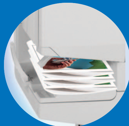
The Booklet Finisher produces professional-quality folded and stapled booklets.