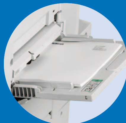
Use the standard 100-Sheet Bypass for printing on labels and special papers.