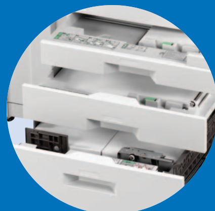
The CLP35 can be supplemented with additional paper sources up to a maximum of 3,100 sheets.