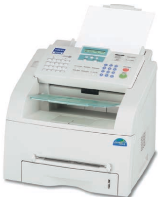
A 50-sheet Automatic Document Feeder makes swift work of scanning and storing multi-page outgoing faxes.

Get outbound fax jobs off to a quick start when you scan up to 50 pages – using the 3820's standard Automatic Document Feeder – in as little as 1.5 seconds per page.